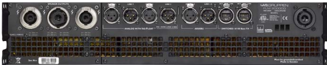
PLM 20000Q Neutrik speakON connector version shown.

PLM Series Powered Loudspeaker Management systems are equipped with Dante, a self-configuring digital audio networking solution from Audinate® of Australia. Based on the newest developments in networking technology, Dante provides reliable, sample-accurate audio distribution over Ethernet with extremely low latency. Dante incorporates Zen™, an automatic device discovery and system configuration protocol which enables PLM Series products and other Dante-enabled products to find each other on the network and configure themselves.