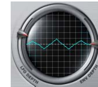
Low LFO Speed