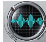
High LFO Speed

The LFOs are Low Frequency Oscillators that acts as modulators for the effect. The oscillators generate a cyclic waveform at a frequency below the audible range. Depending on the speed and the wave shape that you select for the LFOs, you can achieve effects such as wah-wah and tremolo.